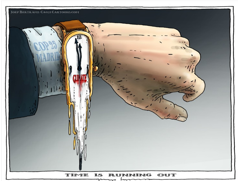
Joep Bertrams, Het Parool / Courtesy of Cagle.com