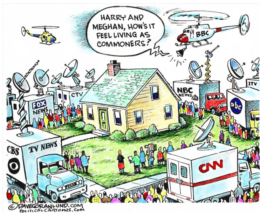
Dave Granlund / Courtesy of Cagle.com