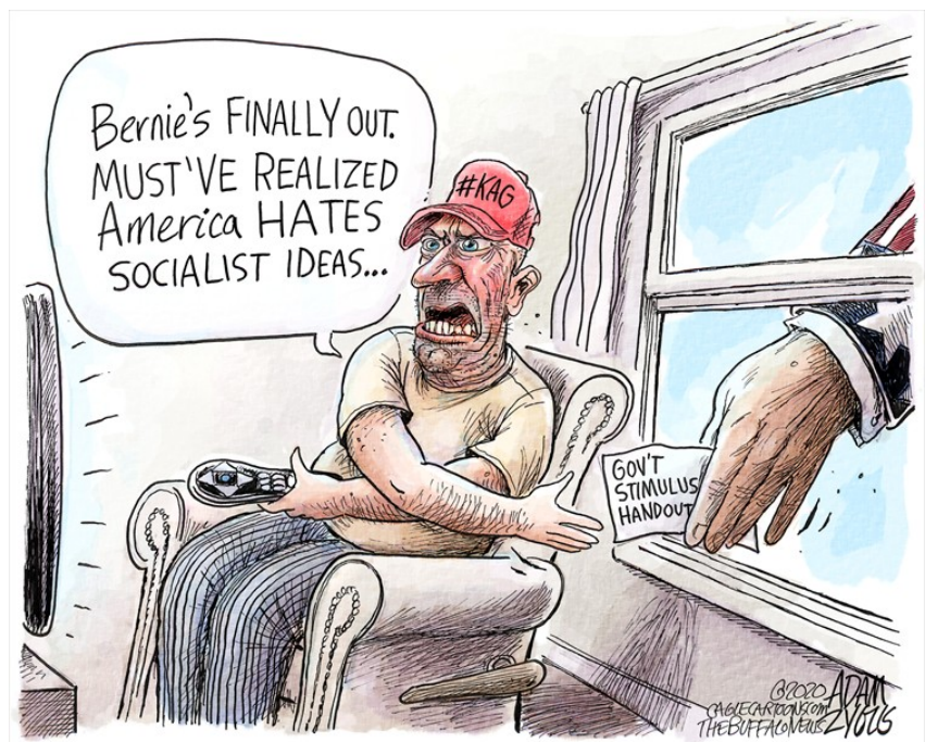
Adam Zyglis, The Buffalo News / Courtesy of Cagle.com