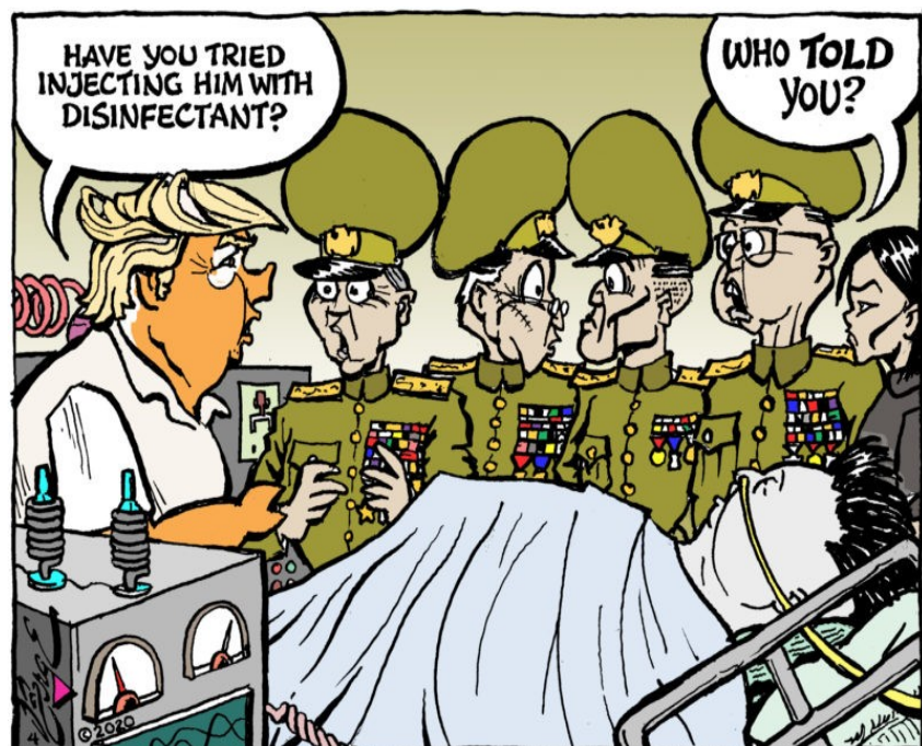
Paul W. Berge / Courtesy of AAEC