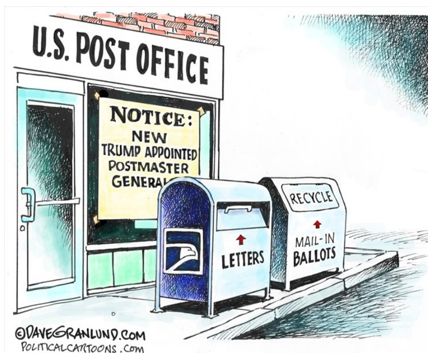
Dave Granlund / Courtesy of Cagle.com