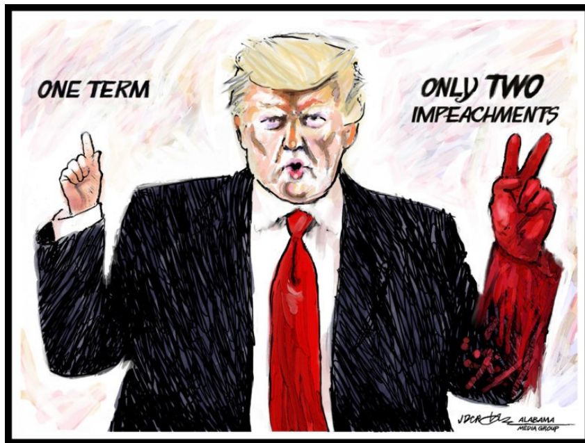
J.D. Crowe, Alabama Media Group / Courtesy of AAEC