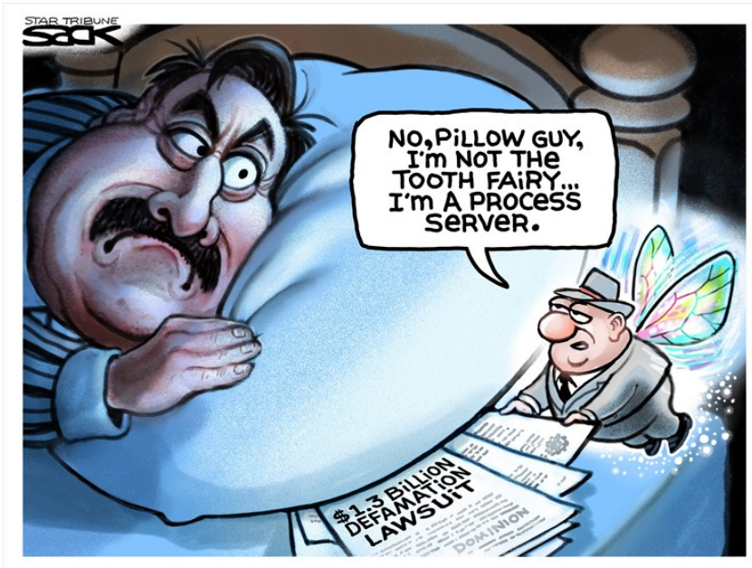
Steve Sack, The Minneapolis Star Tribune / Courtesy of Cagle.com