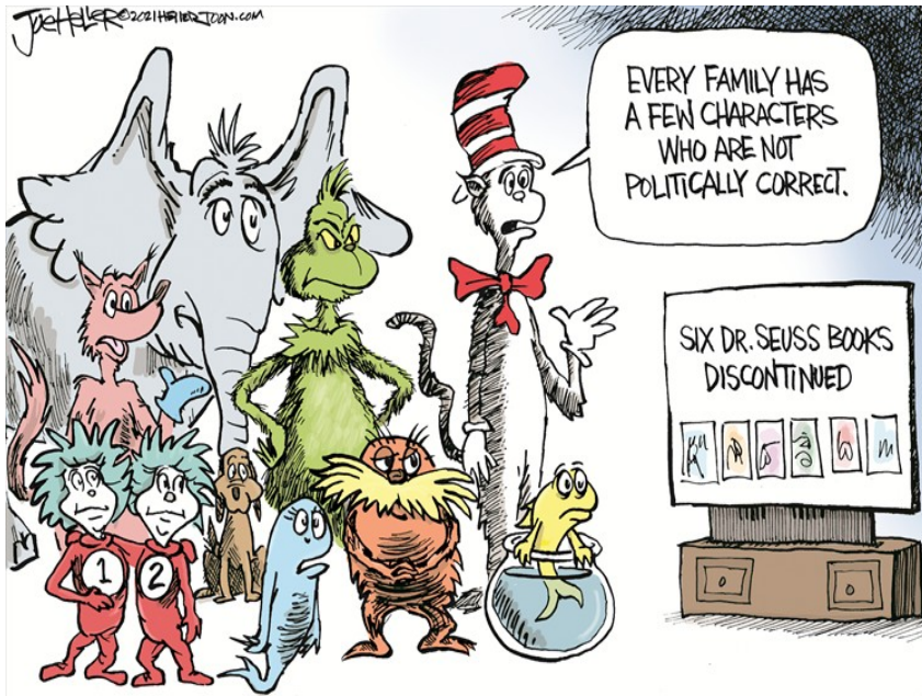
Joe Heller, Green Bay Press-Gazette / Courtesy of Cagle.com