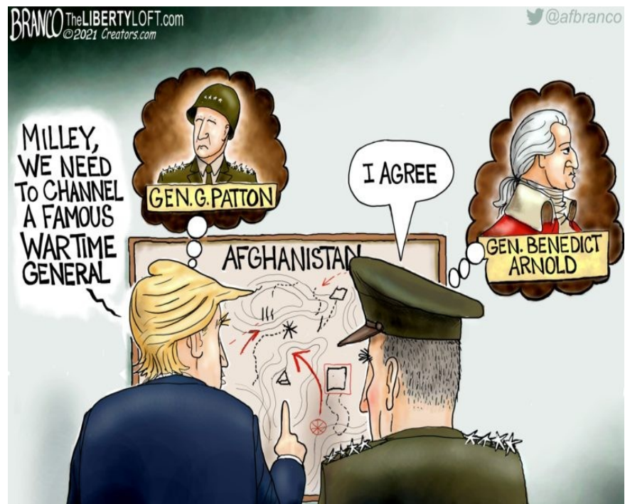
Antonio F. Branco / Courtesy of AAEC