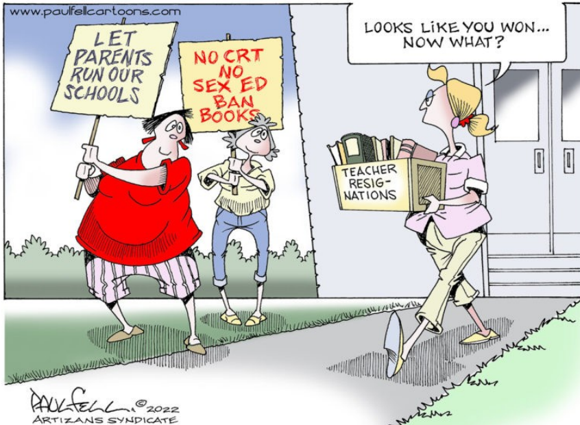
Paul Fell / Courtesy of AAEC