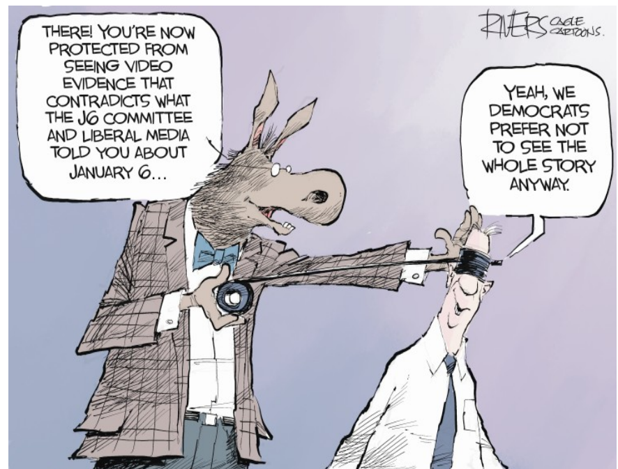
Rivers / Courtesy of Cagle.com