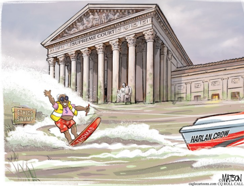
R.J. Matson, Roll Call