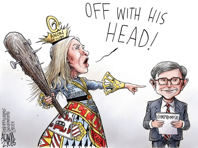
Adam Zyglis / Courtesy of Cagle.com