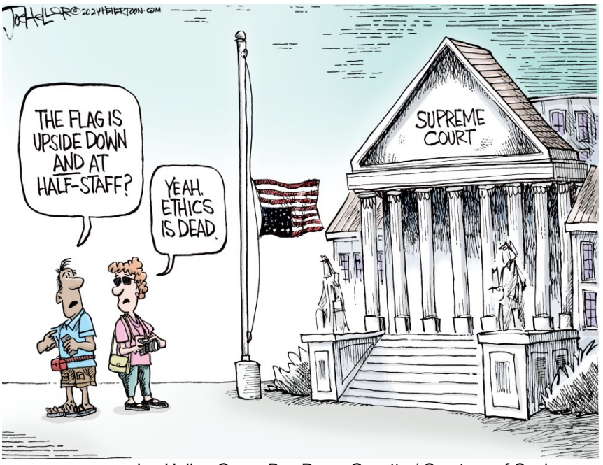
Joe Heller, Green Bay Press-Gazette / Courtesy of Cagle.com