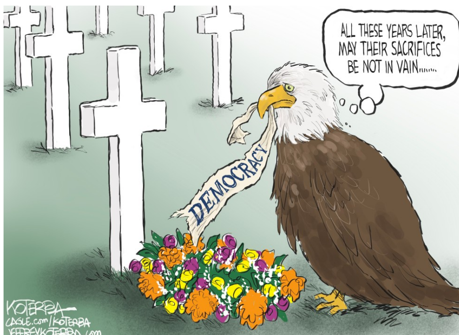
Jeff Koterba / Courtesy of Cagle.com