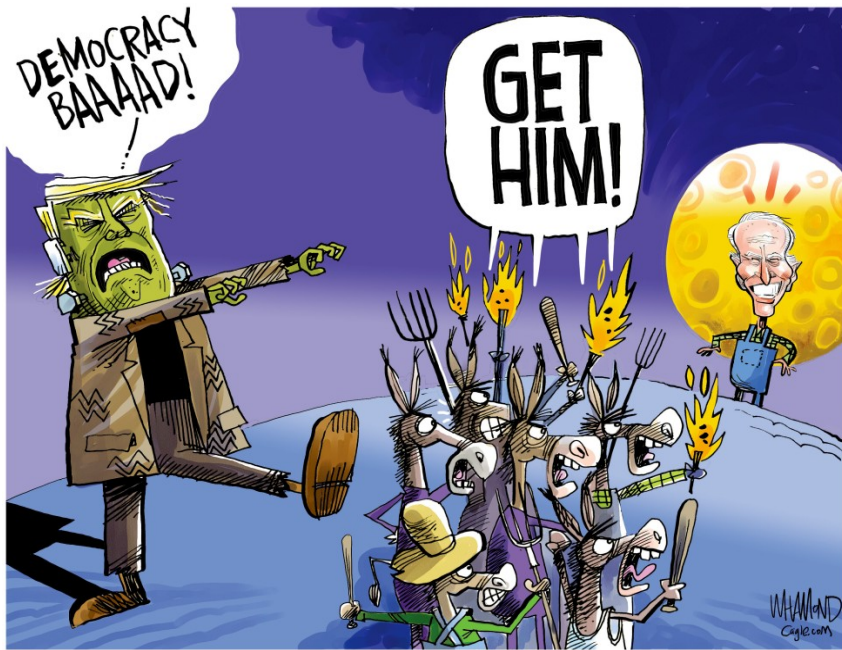
Dave Whamond / Courtesy of Cagle.com