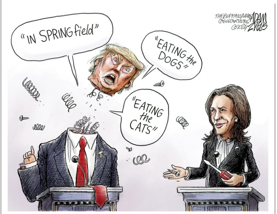
Adam Zyglis, The Buffalo News

1. What do these cartoons say about the debate between presidential candidates Donald Trump and Kamala Harris?