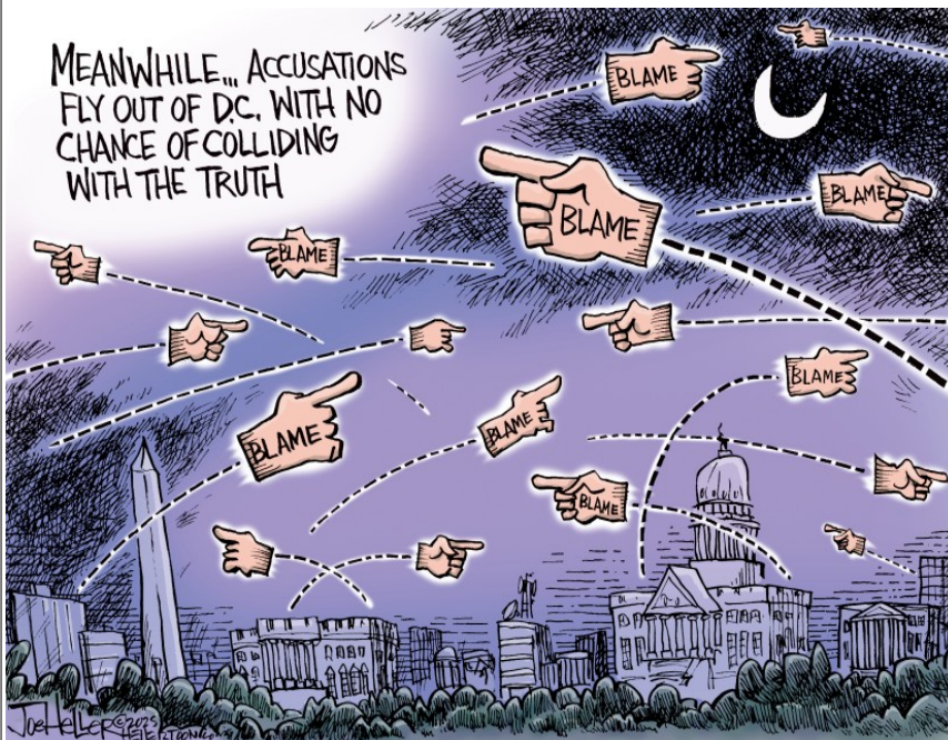
Joe Heller, Green Bay Press-Gazette / Courtesy of Cagle.com