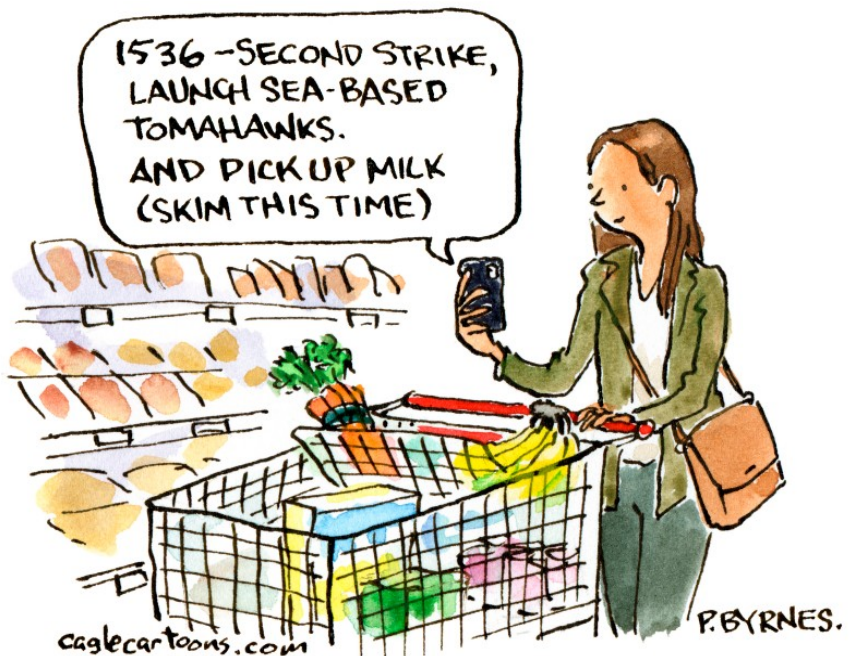
Pat Byrnes / Courtesy of Cagle.com