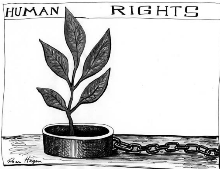
HAGEN / Verdens Gang, Norway

Universal Declaration of Human Rights (UN website) http://www.un.org/Overview/rights.html