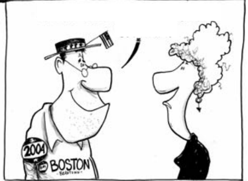
Cartoon courtesy Eric Devericks / Seattle Times