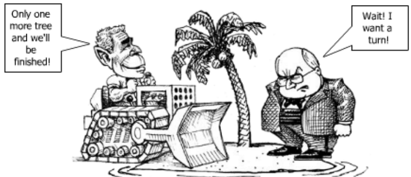
Cartoons from the Cartoon Playground Gallery

Find the Cartoon Playground online at http://www.funnytimes.com/playground/