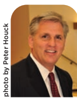
Rep. Kevin McCarthy — House Minority Leader

When midterms roll around, members of the minority party hope voters who are unhappy with the president's policies will cast their ballots for their party's candidates.