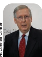
Sen. Mitch McConnell — Senate Minority Leader

If the Republican Party should win a majority in the U.S. Senate or House, they will work against some of the policies of President Joe Biden. When a president's party controls the majority in the House and Senate, it's much easier for them to get their ideas and goals enacted.