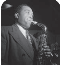
Kansas Citian Charlie Parker was a jazz saxophonist and composer. His nickname was "Bird."

Kansas City is known for barbecue and as a "cradle of jazz music," and St. Louis is noted for its blues music.