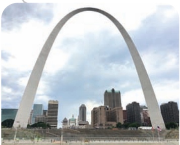
The Gateway Arch in St. Louis is a monument to western expansion. Visitors can ride to the top and look out small windows over the city.

The capital is Jefferson City, near the center of the state. Kansas City lies on the western border with Kansas and the Missouri River; it's the largest city. St. Louis, along the Mississippi River on the eastern edge of the state, is sometimes called the Gateway to the West.