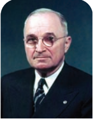
Harry S. Truman

• Harry Truman , who was born in Lamar, Missouri, and grew up in Independence, became president during World War II. He was the vice president when President Franklin Roosevelt died in April 1945. He served until 1953.