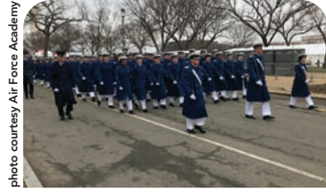
Air Force Academy cadets march in the inaugural parade in 2017.

Donald J. Trump was first elected president in 2016. He was elected again on Nov. 5, 2024.