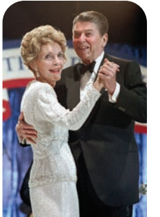
President Ronald Reagan and his wife, Nancy, dance at an inaugural ball in 1985.

The first inaugural ball took place in 1809. Some presidents have canceled the parties because they thought the occasion should be more serious.