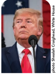
Donald J. Trump

• Vice President-elect JD Vance will take the oath of office first. The oaths are given by the chief justice of the United States, John Roberts.