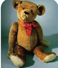
While Roosevelt was president, a toymaker started making bears, calling them “Teddy.”