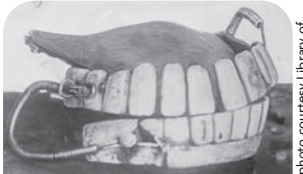
Like many people in Washington’s day, he had many dental problems. His set of teeth (above) was made of ivory.