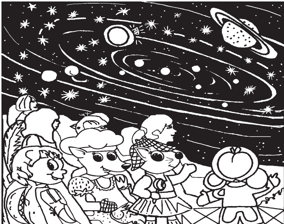
Mini Spy Classics appear in the first issue of each month.

Mini Spy and her friends are visiting a planetarium. See if you can find the hidden pictures. Then color the picture.