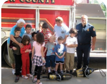
Kids with autism visit a fire station and meet a firefighter.