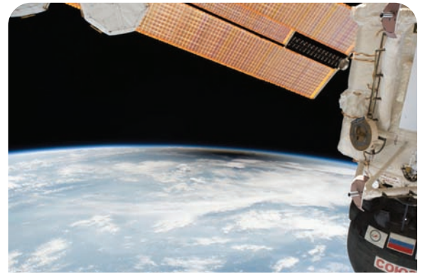
On Aug. 21, 2017, the International Space Station crossed the path of the eclipse three times as it orbited the Earth. Six astronauts aboard took photographs of the umbra from space.

There's a big event happening up in the sky in a few days. Are you ready for the 2024 solar eclipse? The Mini Page explores the science of the eclipse and safe ways to observe it.