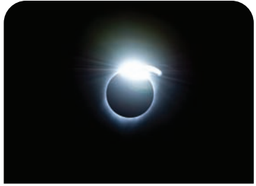
The diamond ring effect during the 2017 total solar eclipse.

As the eclipse becomes total, the last bits of sunlight streaming through valleys on the moon cause a bright flash, known as