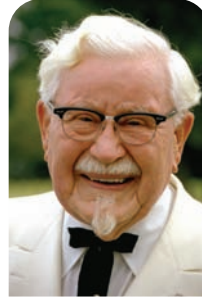
Col. Harland Sanders

• Col. Sanders was not a colonel in the Army; the state honors Kentuckians who have been of great service to the community with the title, known as a Kentucky colonel .