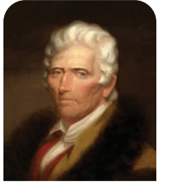
Daniel Boone 1734-1820

• Daniel Boone was a pioneer who explored the area west of the 13 Colonies in the late 1700s. He is known for creating the Wilderness Road through the Appalachian Mountains.