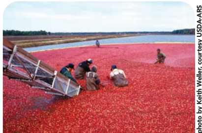
Workers harvest cranberries in fields flooded with water.