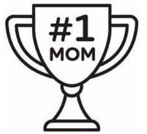
Cut out this trophy, color it, and use it to decorate a Mother's Day card for Mom.