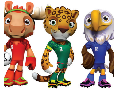
Maple, Zayu and Clutch

With three host countries, FIFA World Cup has introduced three mascots: Maple the moose from Canada, Zayu the jaguar from Mexico, and Clutch the bald eagle from the United States.