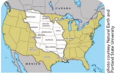
The Louisiana Purchase is shown in white.

The state was a part of the Louisiana Purchase, western territory the U.S. bought from France in 1803 for $15 million.