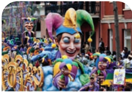
Mardi Gras parade in New Orleans.

It is a celebration filled with parades and balls. It attracts many visitors. Mardi Gras begins each year on the day before Ash Wednesday.