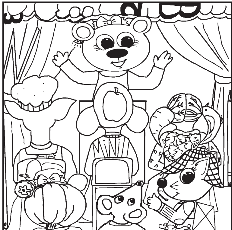
Mini Spy Classics appear in the first issue of each month.

Mini Spy and her friends are listening to a speech at the Republican convention. See if you can find the hidden pictures. Then color the picture.