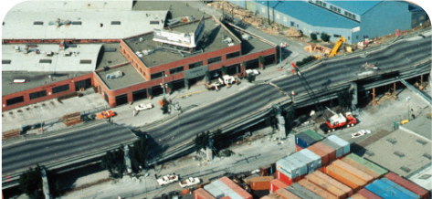
The Loma Prieta earthquake in 1989 buckled and broke this overpass.

In April 1906, parts of northern California were struck by a strong earthquake along the San Andreas Fault. The main quake was followed by many aftershocks, and a large fire started in San Francisco, lasting several days. Experts think up to 3,000 people may have died as a result of the earthquake.