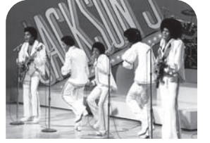
The Jackson 5 perform in 1972.

• Pop artist Michael Jackson and his brothers and sisters were born in Gary, Indiana.