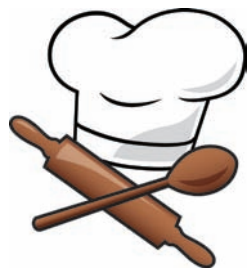
* You'll need an adult's help with this recipe.