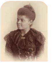
Ida B. Wells

• Ida B. Wells was born into slavery in Holly Springs in 1862. She was one of the founders of the NAACP (National Association for the Advancement of Colored People); she was also a journalist and teacher. Wells fought for women's rights, including the right to vote. She died in Chicago in 1931.