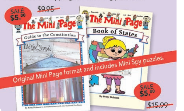
The Mini Page © 2022 Andrews McMeel Syndication

Books from The Mini Page are wonderful resources and make great gifts! See all of our Mini Page products at MiniPageBooks.com , or call 844-426-1256 for more information. Mail payment to: Andrews McMeel Universal, Mini Page Books, 1130 Walnut, Kansas City, MO 64106. Include $6.00 shipping and handling per order.