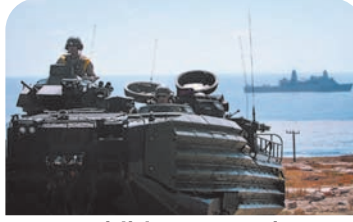
An amphibious assault vehicle lands on an island near San Clemente, California, for exercises.