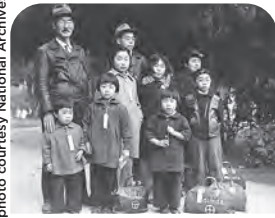
A Japanese American family waits to be interned (confined in a camp).

In 1942, the federal government forced all Japanese Americans on the West Coast, including American citizens, to leave their homes and lives and go to internment camps in several western states. (To intern means to confine people, especially during a war.)