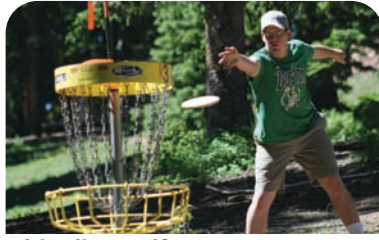
This disc golfer putts out on a hole during a tournament.

A putter disc would be most like a regular Frisbee, designed to fly shorter distances and with less force than other discs.