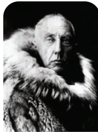
Roald Amundsen, a Norwegian explorer, was the first to reach the South Pole in December 1911.

There are no indigenous , or native, people in Antarctica. There are, however, many species of animals.