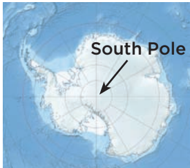
map by Alexr12

Antarctica does not belong to any one country. It is governed by the Antarctic Treaty System, which prohibits military activities and