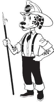
This is how Sparky looked in 1951.

It's Fire Prevention Week, so The Mini Page talked with Sparky the Fire Dog and other experts about protecting our families and homes from fire. This year's theme is "Learn the Sounds of Fire Safety."