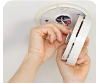
Mount alarms high on the wall or on the ceiling. Remember, smoke rises.

Smoke alarms should be installed in every bedroom, outside each sleeping area and on every level of your house, even the basement.