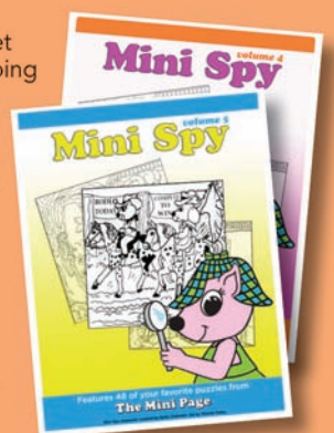
©2017 Blue Ox Technologies Ltd. Download the app on Apple and Amazon devices.

Mail payment to: Andrews McMeel Universal, Mini Page Books, 1130 Walnut, Kansas City, MO 64106.