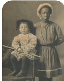
In the mid-1800s, enslaved girls might take care of babies, wash diapers and mend clothing.