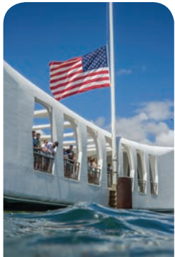
As a sign of mourning and respect, the American flag is flown at half-staff until noon on Memorial Day.

In many cities and towns, veterans and active service members march in parades or attend special events for Memorial Day.