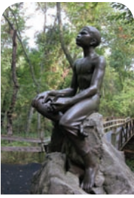
This statue of Carver as a boy was sculpted in 1960. It sits along the Carver Trail.

The George Washington Carver National Monument in Diamond, Missouri, honors the scientist who worked to produce better food crops and products. He is best known for inventing peanut butter as we know it today.