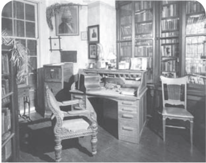
Frederick Douglass' study.

Brown v. Board of Education National Historic Site in Topeka, Kansas, honors the Supreme Court case of 1954. The court ruled that the government must allow students of all races to go to public schools together.