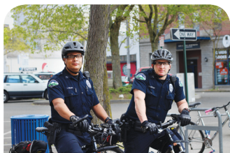
These police officers in Bellingham, Washington, use bikes to patrol the city.

Police officers are using bikes to get around cities more easily and have more contact with people.