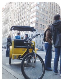
This pedicab is in New York City.

compartment attached, are popular in many cities around the United States. People hire the rider to deliver them to another location, just as a taxi cab would.