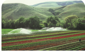
Crops are watered by irrigation systems.