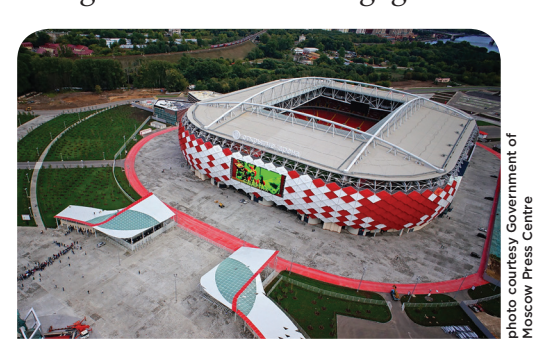
The Spartak Stadium in Moscow holds more than 45,000 spectators.