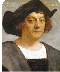
This painting of Christopher Columbus was made in 1519.

Christopher Columbus made four voyages across the Atlantic Ocean between 1492 and 1506. He explored the West Indies and along the coast of South and Central America. His discoveries led Europeans to new lands.